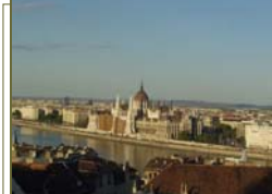
Annual COEHRE Conference 2005 Budapest, Hungary