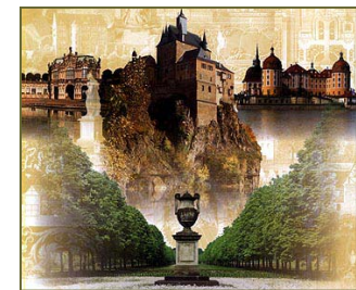
COHEHRE CONFERENCE 2004, Saxony, Germany