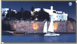
NACNAH Conference 2004, Puerto Rico

NACNAH for International Cooperation is Governed by an Executive Board comprised of four officers: President, Vice President, Secretary and