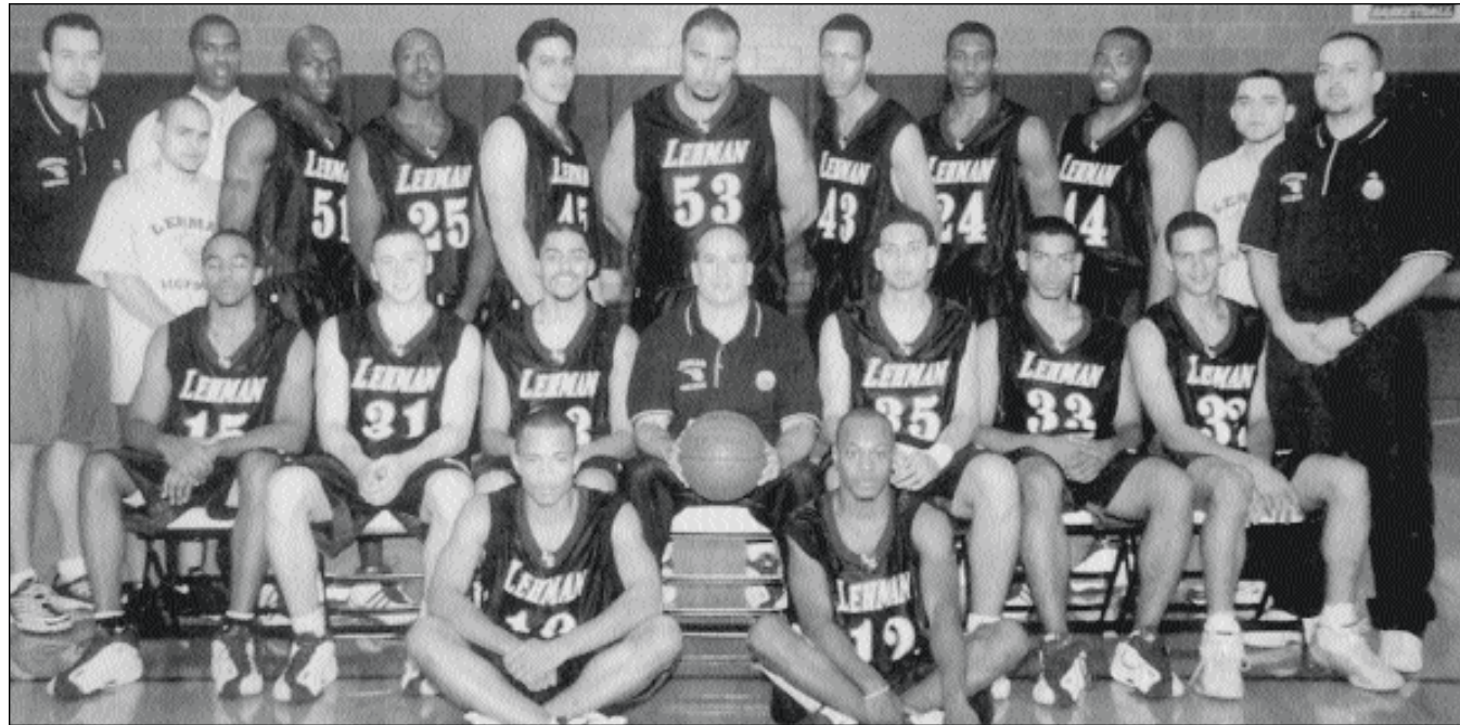
2001-02 Lehman College Men's Basketball