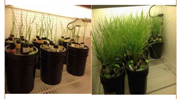
Fig 1: Triticum turgidum lines grown in hydroponic solution in elevated and ambient CO<sub>2</sub> conditions

Two near isogenic wheat lines (8982 TL-L and 8982 TL-H) were used as a model in which to study these processes. These lines differ in grain Cd concentrations by 2.5 fold but are otherwise similar. The low Cd line retained more Cd in the roots and translocated less Cd to the shoots than the high Cd lines (Clarke et al., 1997; Hart et al., 1997). The comparison between the two lines will prove essential to the understanding and characterization of both Cd and nutrient transport and accumulation in the grains as a result of elevated carbon dioxide concentrations in the atmosphere. The main objective of the study is to understand the effect of elevated carbon dioxide on the nutrient and cadmium uptake and accumulation in the grains.