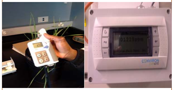
Fig 2: Relative chlorophyll content measurement

Relative chlorophyll content (RCC) was recorded weekly using SPAD 502 Chlorophyll meter to ensure proper growth and to assess the physiological status of the plants. The plants will be harvested at reproductive maturity to assess the concentration of Cd in the different tissues. The harvested will be ground and digested and analyzed for Cd using SpectrAA 220FS atomic absorption spectroscopy (Varian, Walnut Creek, CA) in flame and the furnace mode.