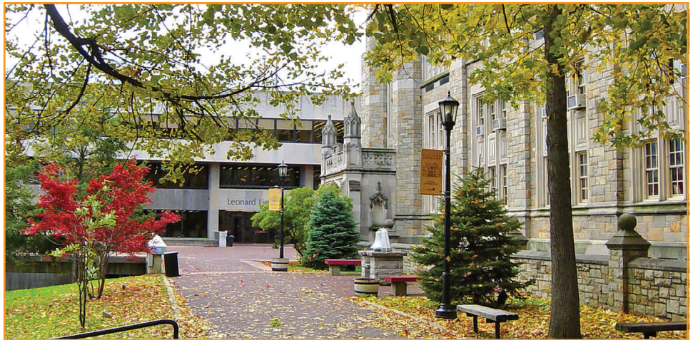
Leonard Lief Library