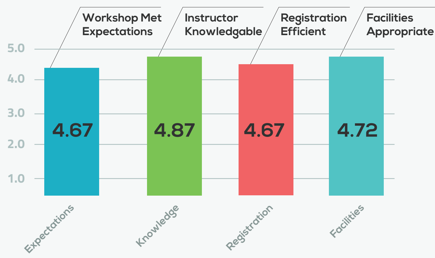
Spring 2015 Workshop Evaluation Mean Overall Ratings from 5=Strongly Agree to 1=Strongly Disagree