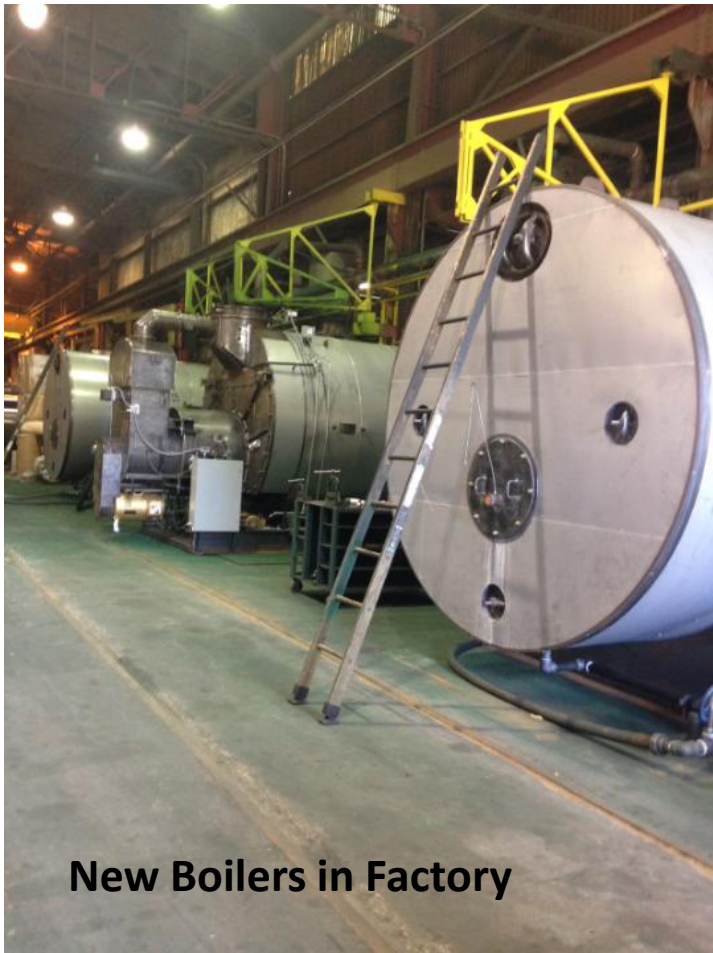
New Boilers in Factory