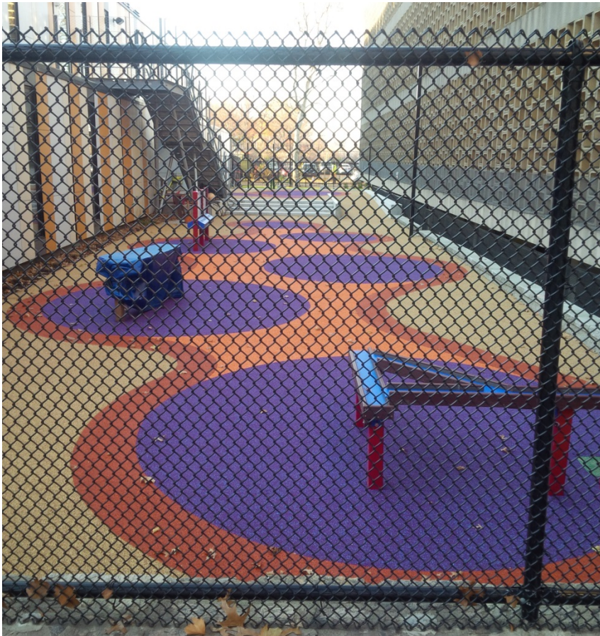
Playground between Shuster & Child Care Center