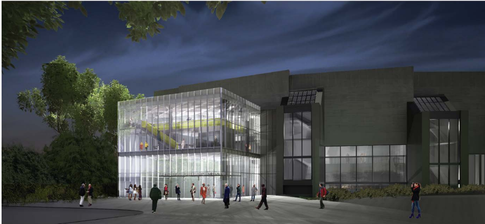
VIEW FROM MUSIC BUILDING

MICHIELLI + WYETZNER ARCHITECTS 143 West 29th Street 4A New York, NY 10001 www.mwarch.net