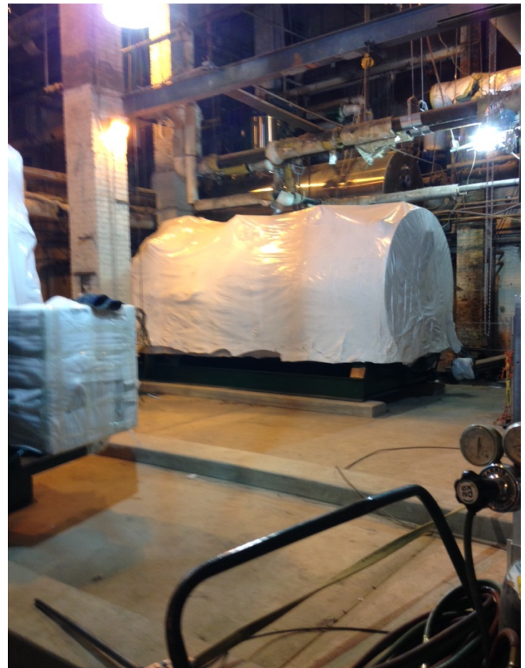
New Boilers in Plant

Currently in construction (demolition phase) – boilers fabricated and delivered to Lehman