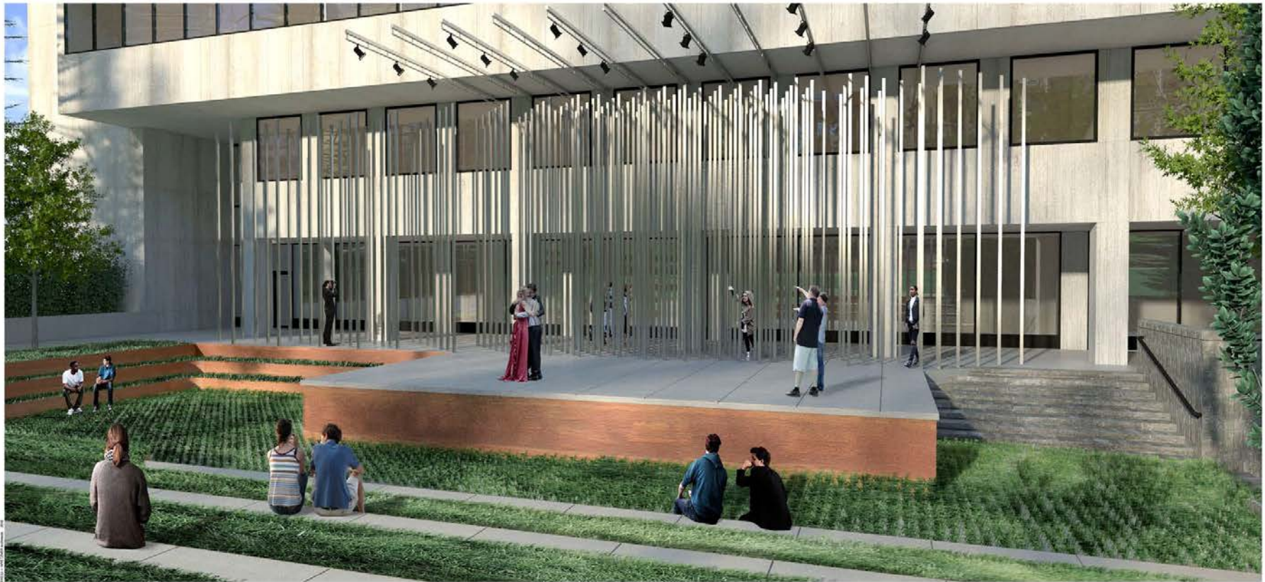
LEHMAN COLLEGE AMPHITHEATER NORTH EAST PERSPECTIVE