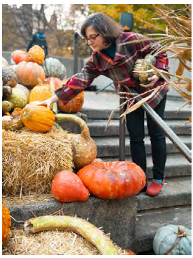
As the photos show, the Pumpkin Smash—an awareness-raising activity—has become a highlight of the fall season at Lehman College.

Dumpkin Smash is a fun-filled annual event developed in collaboration with the New York City Compost Project and hosted by Lehman College since 2014. Its purpose is to raise awareness of, and participation in, environmental sustainability.