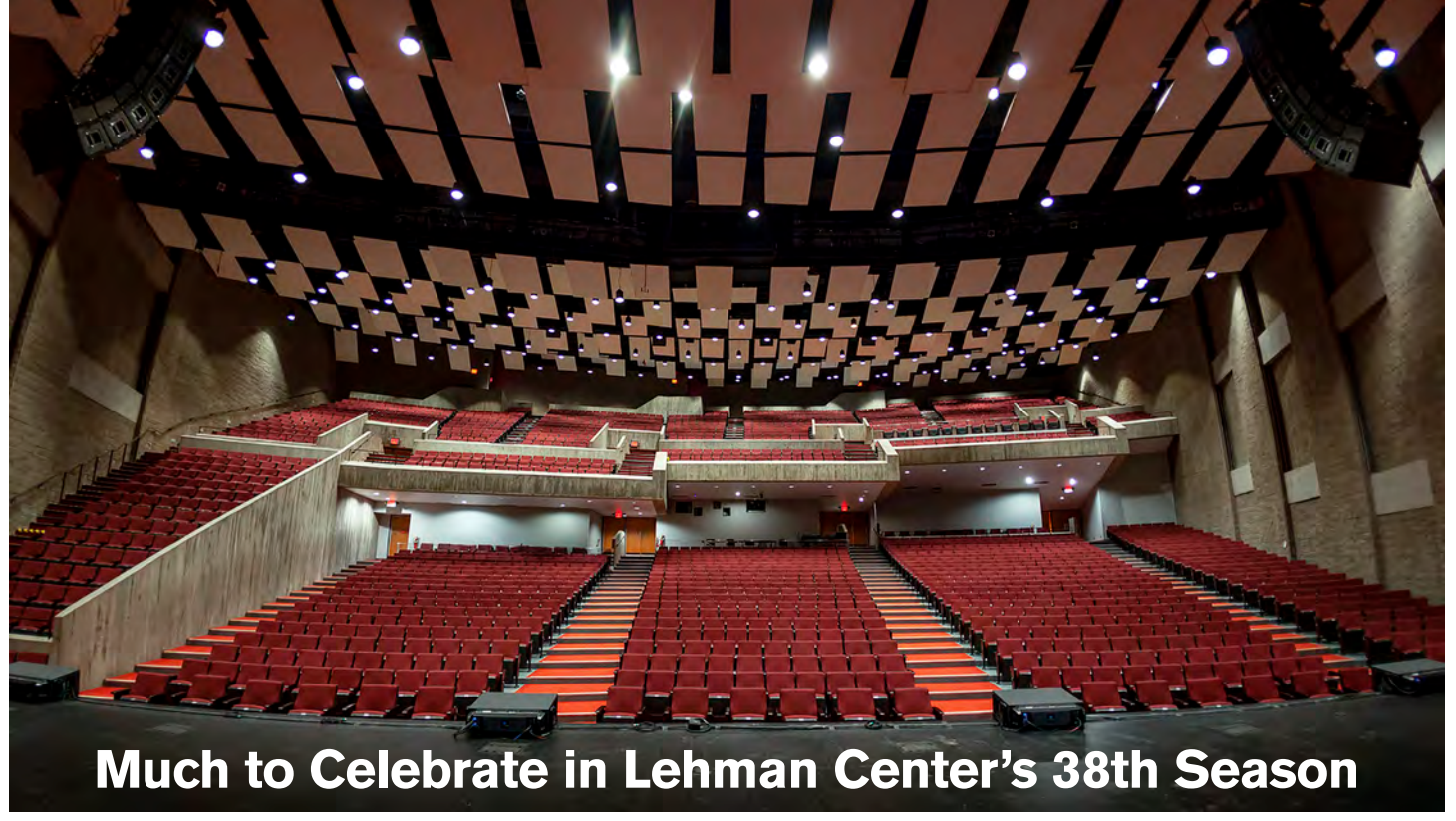
The 2,278-seat Performing Arts Center auditorium has been called the "Lincoln Center of the Bronx" and is the largest facility of its kind in the borough.

ehman Center for the Performing Arts opened its 38th season in a renewed facility with brand new seating and carpeting in the lobby. The $15.4 million, 18-month upgrade is still underway. The entire renovation project, including an attractive new addition, will be completed in late Spring 2019.