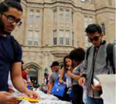
At the Fall student orientation, freshmen assembly toiletries kits for homeless shelters.