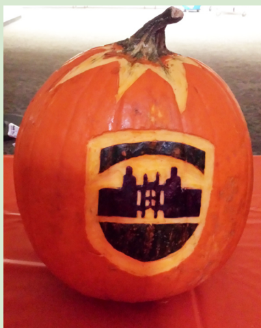
In the Halloween spirit, Nayyarsons gave away free pumpkins and sponsored a Pumpkin Carving and Decorating Contest for faculty and staff. See the prize winners and other fanciful entries on page 2. The pumpkin above is the creation of the Budget and Planning Office.