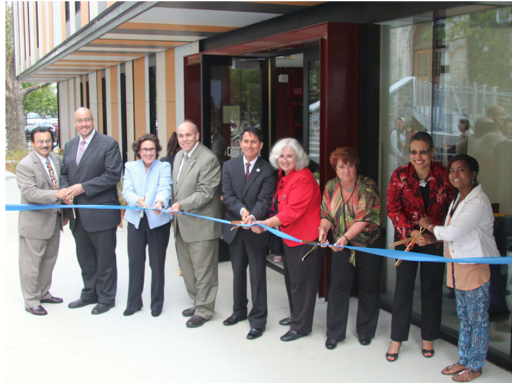
Joyful ribbon-cutters at the official Child Care Center dedication.